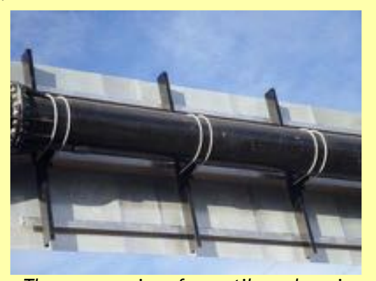
The average size of a cantilever base is around four feet in diameter, with a twenty-foot deep caisson foundation. The

While traveling by an Interstate sign, something else that rarely gets noticed is the sheer size of these signs. An average interstate sign is around 17 feet wide by 11 feet tall. Considering a standard living room is 10 feet by 10 feet, that's a