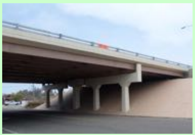
The I-25 Bridge over Indiana Avenue recently received its initial coat of stain as one of the finishing touches on its rehabilitation.

First, the team pressure washed all surfaces with a 3000 psi pressure washer, and then allowed the concrete surface to adequately dry. Next, they used an airless sprayer to apply two coats of DOT sealer/stain to all concrete surfaces on the bridge.