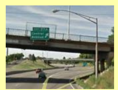
Before photo: bridgemounted sign

Another method to mount signs is using a cantilever, which is one foundation with the sign attached to a monotube, or "arm", that extends over the roadway. Cantilevers tend to be a slightly easier option as it is one foundation pour,