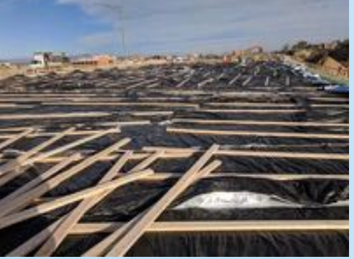
Tarps keep concrete warm on recent bridge deck pour of the new I-25 bridge over the Union Pacific Railroad.

This approach does not work well for asphalt, however. Asphalt needs to stay warm while it is being placed and rolled. In addition, a thin layer of asphalt must be completely compacted within 16 minutes of application. Thicker layers of asphalt have an extended