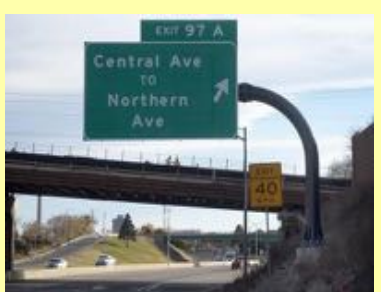
After photo: cantilevermounted sign

mounted on a structure that "bridges" the highway, secured is used for large signs that extend past two lanes of traffic.